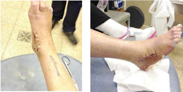
Images from the patient case study 1